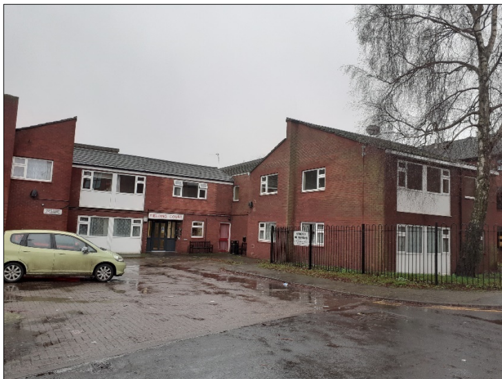
Figure 8 (left)

Looking Southeast from Cradock Street at the front of Fielding Court.