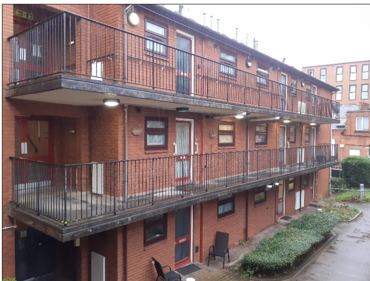
Figure 11 (left)

Looking East from Cradock Street showing B Block.