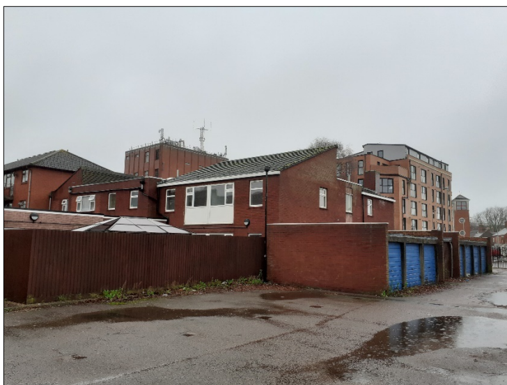
Figure 9 (left)

Looking Southeast from Cradock Street at the front of Fielding Court.