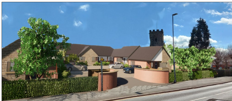
Figure 3 (above) Photo Montage of the Planned Bungalow Scheme to replace Existing Sheltered Accommodation at St Michaels Court, Thurmaston

work forward. Plans Committee is expected to consider the Council's application in February 2024.