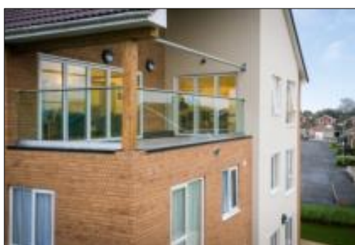
Figure 2 (above left) and 2a (above right) - Riversdale Court, Birstall

Cabinet approval has been gained to demolish and subject to planning permission build 9 bungalows at the St Michael's Court site in Loughborough. A project is in progress to take this