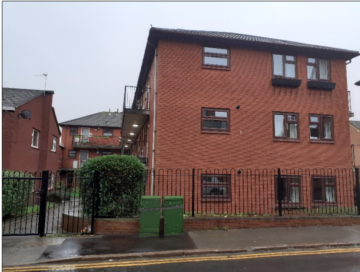
Figure 10 (left)

Looking East from Cradock Street showing B Block.