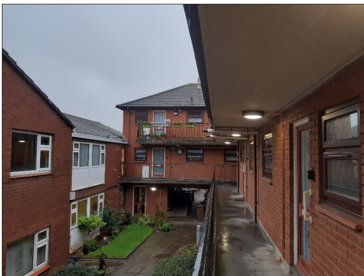
Figure 12 (left)

Looking West towards Cradock Street showing N Elevation of B Block